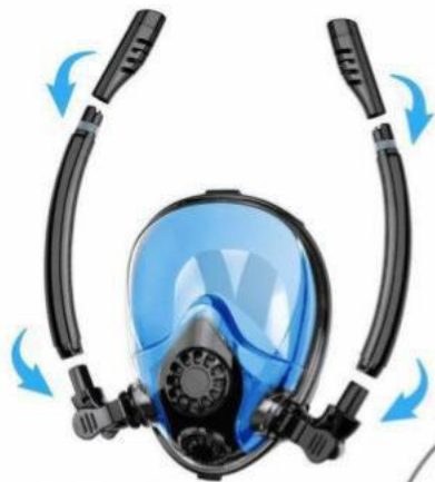
1. Install respiratory tubes on either side