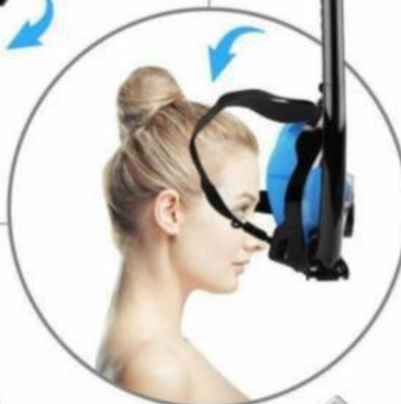
3. Rip off the front protective film of mask