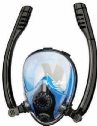
4. Wear the mask from the top downwards