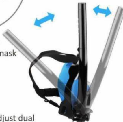
5. Adjust dual respiratory tubes