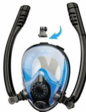
2. Install the camera supporting